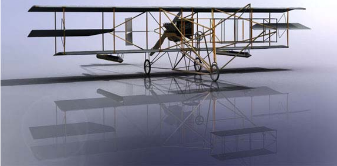
3D model created by Bob Juncosa