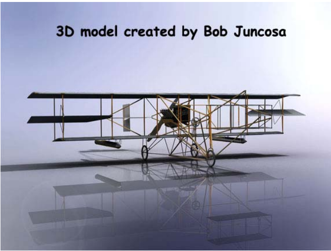
3D model created by Bob Juncosa